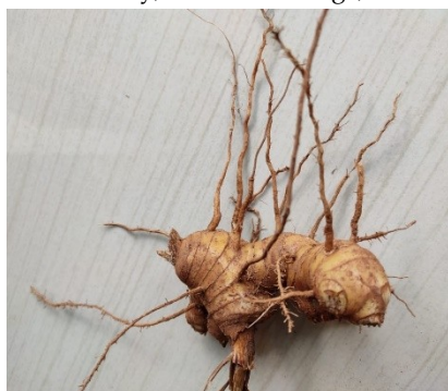
Fig 01: Rhizomes of Zingiber wightianum Thwaites