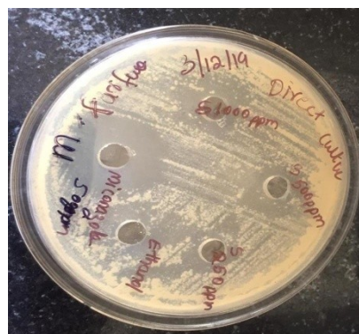
Fig 02 A Ethanolic Extract Against M.furfur A:250µg/ml,B:500µg/ml,C:1000µg/ml D:Miconazole (standard) E:Ethanol(control)