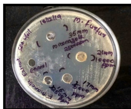
Fig 02B: Ethanolic Extract Against M.furfur A:2500µg/ml, B:5000µg/ml, C:10000µg/ml D: Miconazole (standard) E: Ethanol(control)